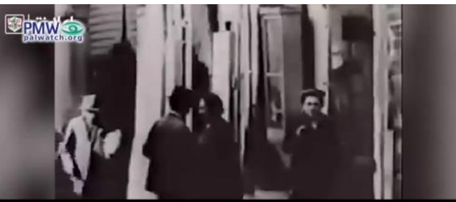
and who according to their [Jews'] worldview are snakes and sons of snakes.