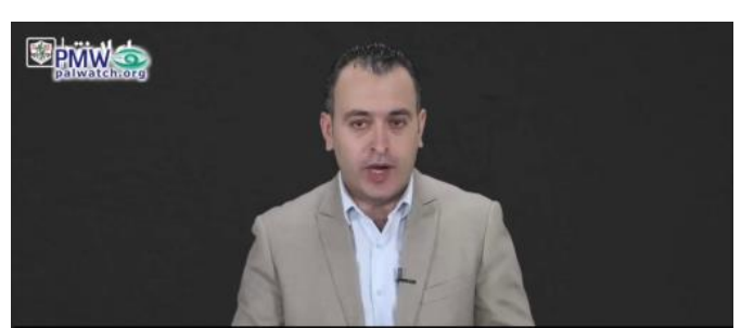
In Europe, the [Jewish] tribe established camps and residential areas,

crowded ghettos in order to separate from other people