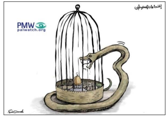
[Official PA daily Al-Hayat Al-Jadida, Aug. 25, 2019]

The cartoon portrays Jews who visit the Temple Mount as a snake with its fangs bared sticking its head through the bars of a bird cage that are rising up from the walls of the Old City of Jerusalem.